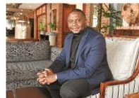
Advanced Management Development Program (AMDP) in Real Estate at Harvard University, US