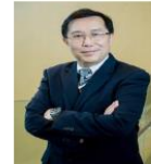
MB BS (Med.Deg-London), LLB (Hons-London), MPH MD (Higher Med Doctoral Deg-CUHK), LLM (Distinct-Arb &DR), DCH (Ireland), FRCP (London & Ireland), FCI Arb (UK), Hon FFPH (UK)